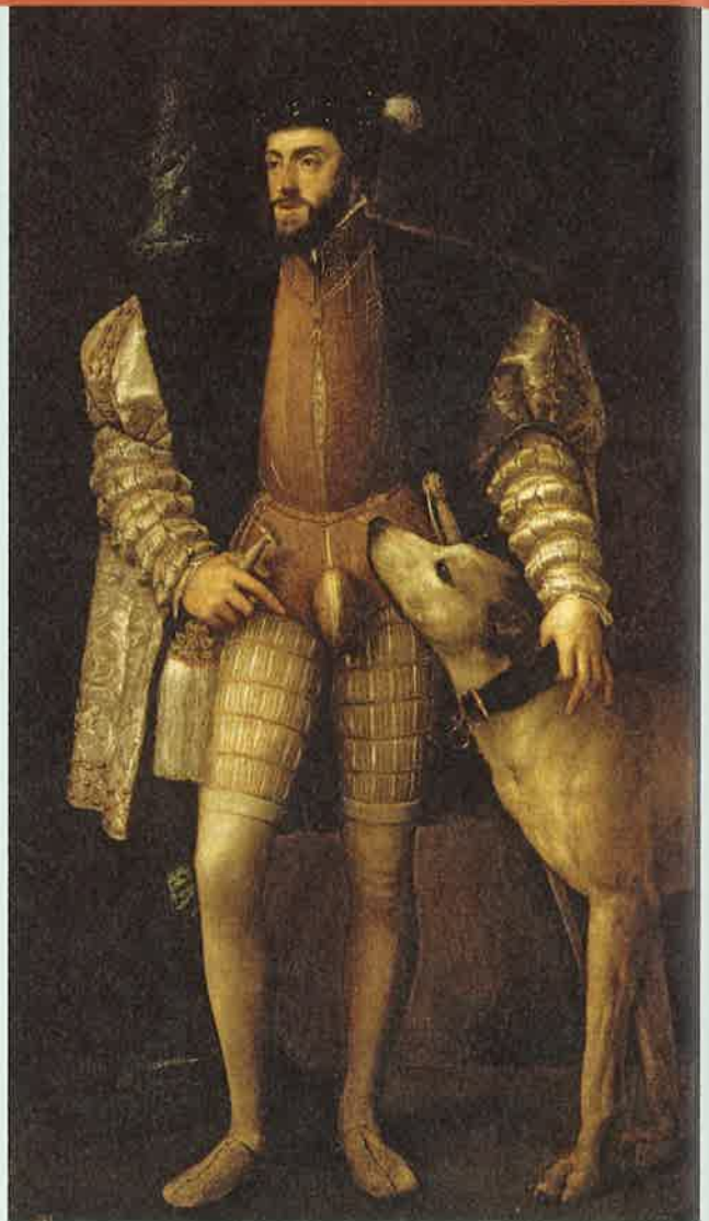
The Venetian painter Titian's portrait of Emperor Charles V with one of his hunting dogs.

level as their married brothers. Unmarried men in Venice, for example, could not be part of the ruling council. (See “Living in the Past: Male Clothing and Masculinity,” above.)