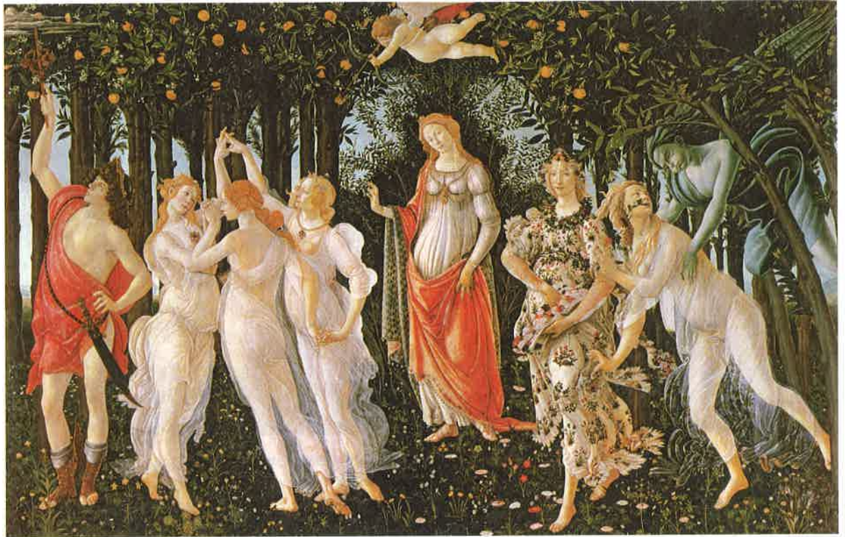
Botticelli, Primavera (Spring), ca. 1482 Framed by a grove of orange trees, Venus, goddess of love, is flanked on the right by Flora, goddess of flowers and fertility, and on the left by the Three Graces, goddesses of banquets, dance, and social occasions. Above, Venus's son Cupid, the god of love, shoots darts of desire, while at the far right the wind-god Zephyrus chases the nymph Chloris. The entire scene rests on classical mythology, though some art historians claim that Venus is an allegory for the Virgin Mary. Botticelli captured the ideal for female beauty in the Renaissance: slender, with pale skin, a high forehead, red-blond hair, and sloping shoulders.

arts,” but only as “minor” or “decorative” arts. (The division between “major” and “minor” arts begun in the Renaissance continues to influence the way museums and collections are organized today.) Like painting, embroidery changed in the Renaissance to become more naturalistic, more visually complex, and more classical in its subject matter. Embroiderers were not trained to view their work as products of individual genius, however, so they rarely included their names on the works, and there is no way to discover their identities.