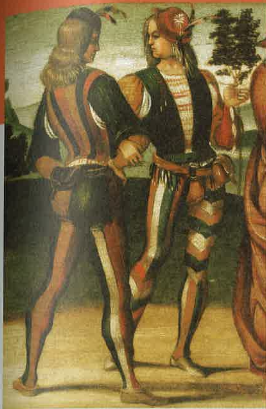
Two young men, who are side figures in The Adoration of the Magi , by Luca Signorelli (1445–1523).