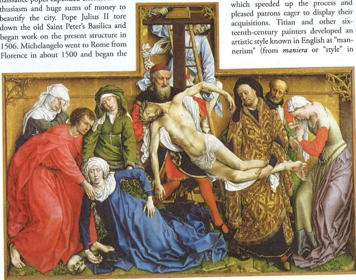
Descent from the Cross, ca. 1435 Taking as his subject the suffering and death of Jesus, a popular theme of Netherlandish piety, Rogier van der Weyden shows Christ's descent from the cross, surrounded by nine sorrowing figures. An appreciation of human anatomy, the rich fabrics of the clothes, and the pierced and bloody hands of Jesus were all intended to touch the viewers' emotions.

Venice became another artistic center in the sixteenth century. Titian (TIH-shuhn) (1490–1576) produced portraits, religious subjects, and mythological scenes, developing techniques of painting in oil without doing elaborate drawings first, which speeded up the process and pleased patrons eager to display their acquisitions. Titian and other sixteenth-century painters developed an artistic style known in English as "mannerism" (from maniera or "style" in