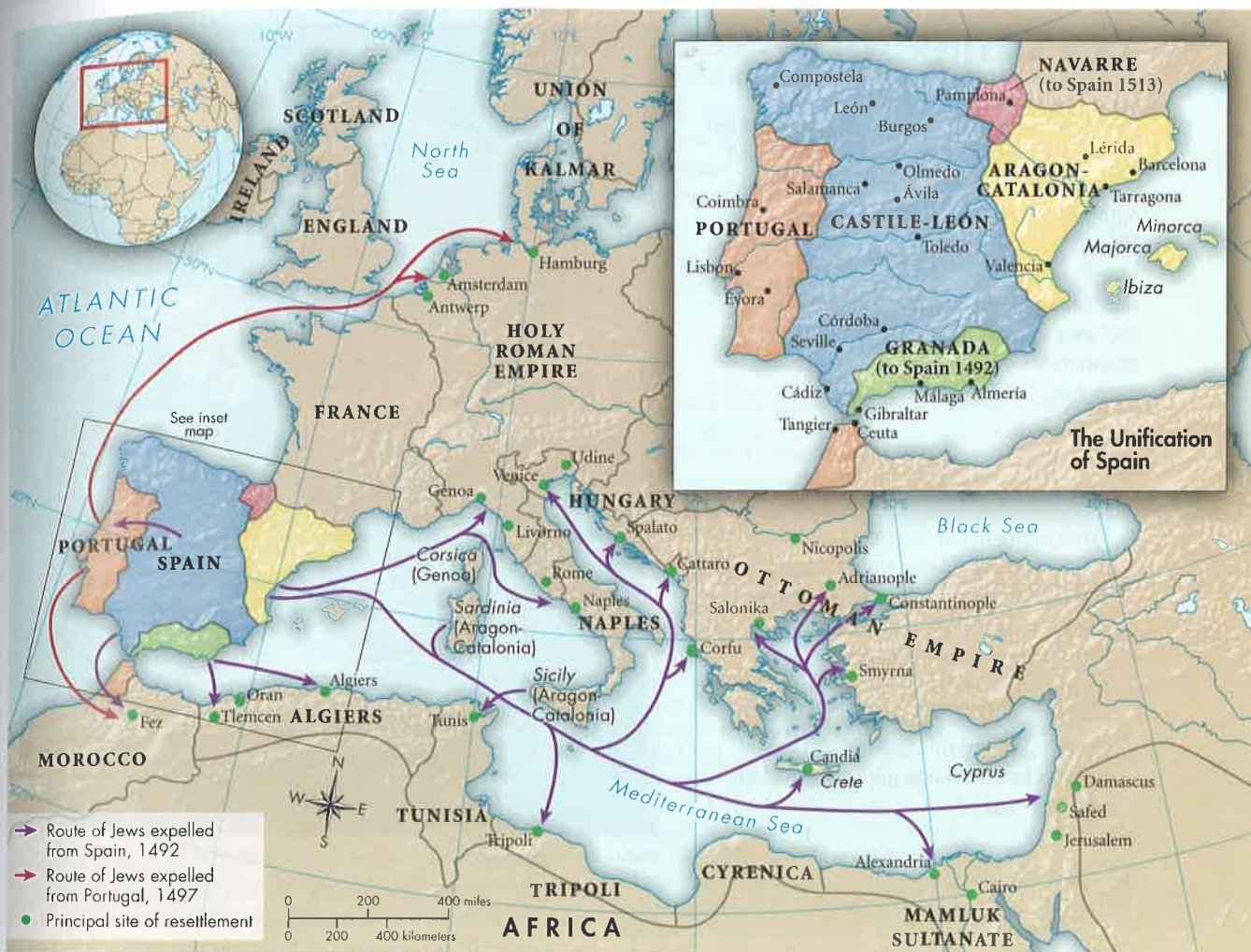
Map 12.3 The Unification of Spain and the Expulsion of the Jews, Fifteenth Century The marriage of Ferdinand of Aragon and Isabella of Castile in 1469 brought most of the Iberian Peninsula under one monarchy, although different parts of Spain retained distinct cultures, languages, and legal systems. In 1492 Ferdinand and Isabella conquered Granada, where most people were Muslim, and expelled the Jews from all of Spain. Spanish Jews resettled in cities of Europe and the Mediterranean that allowed them in, including Muslim states such as the Ottoman Empire. Muslims were also expelled from Spain over the course of the sixteenth and early seventeenth centuries.