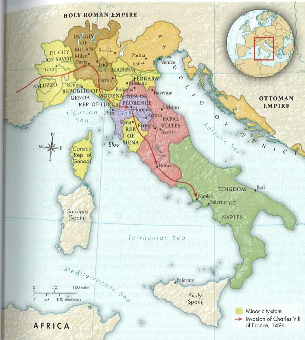
Map 12.1 The Italian City-States, ca. 1494 In the fifteenth century the Italian city-states represented great wealth and cultural sophistication, though the many political divisions throughout the peninsula invited foreign intervention.

and expelled the Medici dynasty. Savonarola became the political and religious leader of a new Florentine republic and promised Florentines even greater glory in the future if they would reform their ways. (See “Primary Source 12.1: A Sermon of Savonarola,” page 362.) He reorganized the government; convinced it to pass laws against same-sex relations, adultery, and drunkenness; and organized groups of young men to patrol the streets looking for immoral dress and behavior. He held religious processions and what became known as “bonfires of the vanities,” huge fires on the main square of Florence in which fancy clothing, cosmetics, pagan books, musical instruments, paintings, and poetry that celebrated human beauty were gathered together and burned.