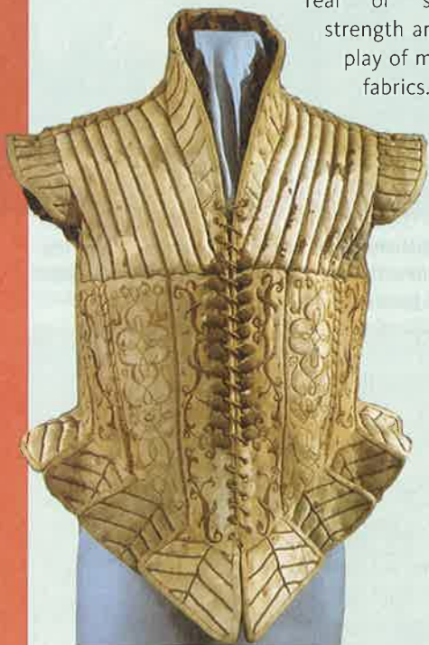
Padded leather jerkin embroidered with silk and metal thread from the late sixteenth century. There are eyelets for tying up hose inside. (Museo Stibbert, Florence)

In the Renaissance wealthy people displayed their power and prosperity on their bodies as well as in their houses and household furnishings. Expanded trade brought in silks, pearls, gemstones, feathers, dyes, and furs, which tailors, goldsmiths, seamstresses, furriers, and hatmakers turned into magnificent clothing and jewelry. Nowhere was fashion more evident than on the men in Renaissance cities and courts. Young men favored multicolored garments that fit tightly, often topping the ensemble with a matching hat on carefully combed long hair. The close-cut garments emphasized the male form, which was further accentuated by tight hose stylishly split to reveal a brightly colored cod-piece. Older men favored more subdued colors but with multiple padded shirts, vests, and coats that emphasized real or simulated upper-body strength and that allowed the display of many layers of expensive fabrics. Golden rings, earrings, pins, and necklaces provided additional glamour.